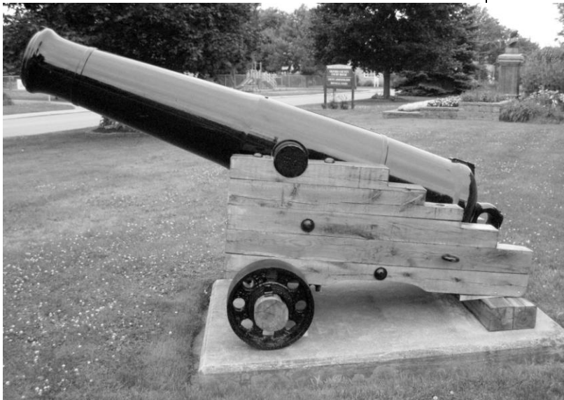
Photo 7 Restored Cannon, on right of Court House Lawn