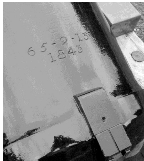
Photo 8 Weight & Year made